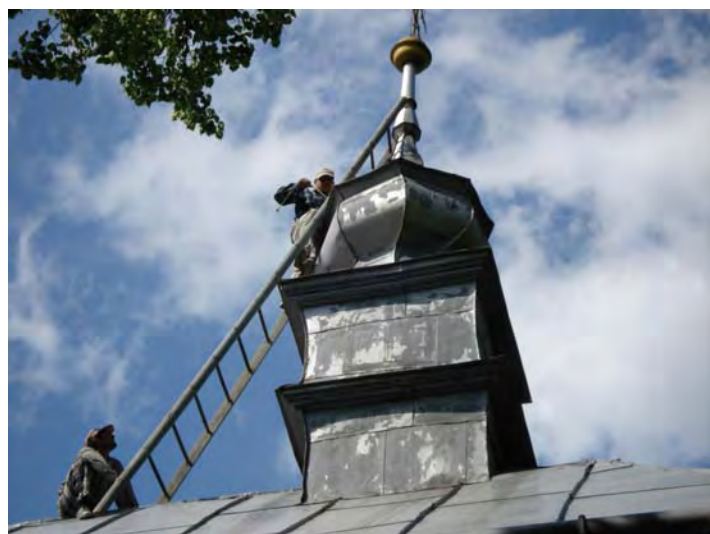
St Michael the Archangel Church, Gorbok, Trans-Carpathia