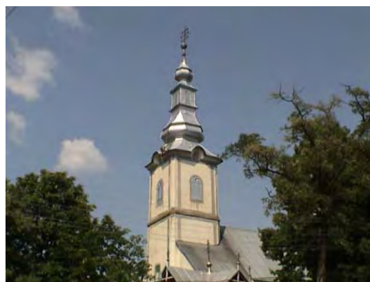
The completed job! Thank you for supporting the work of the Mission Society.