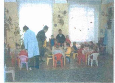
The Korolevo Parish Orphanage