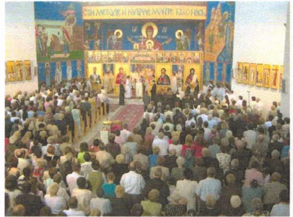
Otpust (Pilgrimage) in honor of SS. Cyril and Methodius, Secovce, Slovakia.

The World Economy and Eastern Europe: The Wall Street Journal and Radio Free Europe have both been reporting that the economic crisis threatens economic growth and reform in much of Eastern Europe. This is the situation in lands which we serve: a) the situation in Slovakia is fairly stable, but she is vulnerable b) Hungary is having serious problems c) Ukraine, outside the euro zone, faces major threats. Your donations are sent in US dollars and the money is received in Slovakia and Ukraine in dollars. Dollars are the preferred currency in Eastern Europe, are received gratefully by contractors, and help seminarians, priests' families, and schools greatly. Thus, your donations go far. Whatever you can set aside during Great Lent as a sacrifice in these hard times will help greatly.