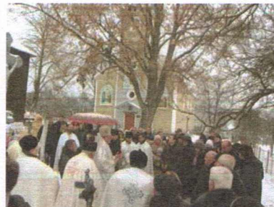
This is another village, Veliki Lazakh: Christmas Day, January 7, 2009

Outdoor Divine Liturgy on January 8 for Old Calendar Christmas, celebrated by Bishop Sasik, in front of former Greek Catholic Church, parish of St. Michael, in Bedykivtsi village, Moroz raion, Transcarpathia. The local Orthodox refuse to share the church—originally built in 1859—with the Catholics, and there is no other building big enough to hold the worshippers. This is why we ask for help for building new churches! Villagers' funds are limited, and American dollars help tremendously in constructing new chapels and parish houses. With these buildings, the faithful can come indoors, and those who are wavering in their commitment to our Church will hopefully come forward.