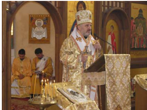
Bishop Peter Rusnak, first Bishop of the Eparchy of Bratislava, Slovakia.

The World Economy and Eastern Europe: The Wall Street Journal and Radio Free Europe have both been reporting that the economic crisis threatens economic growth and reform in much of Eastern Europe. This is the situation in lands which we serve: a) the situation in Slovakia is fairly stable, but she is vulnerable b) Hungary is having serious problems c) Ukraine, outside the euro zone, faces major threats. Your donations are sent in US dollars and the money is received in Slovakia and Ukraine in dollars. Dollars are the preferred currency in Eastern Europe, are received gratefully by contractors, and help seminarians, priests' families, and schools greatly. Thus, your donations go far. Whatever you can set aside during Great Lent as a sacrifice in these hard times will help greatly.