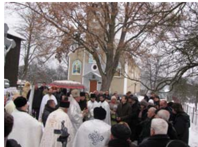
This is another village, Veliki Lazakh: Christmas Day, January 7, 2009

Outdoor Divine Liturgy on January 8 for Old Calendar Christmas, celebrated by Bishop Sasik, in front of former Greek Catholic Church, parish of St. Michael, in Benedykvitsi village, Moroz raion, Transcarpathia. The local Orthodox refuse to share the church—originally built in 1859—with the Catholics, and there is no other building big enough to hold the worshippers. This is why we ask for help for building new churches! Villagers' funds are limited, and American dollars help tremendously in constructing new chapels and parish houses. With these buildings, the faithful can come indoors, and those who are wavering in their commitment to our Church will hopefully come forward.