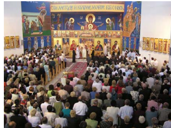
Otpust (Pilgrimage) in honor of SS. Cyril and Methodius, Secovce, Slovakia.

Order by phone at (703) 691-8862 or go online at http://ecpubs.com/index.html .