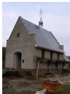
New Church of Saint John Chrysostom , built between two villages in Mukachevo Raion (County) to serve Greek Catholic faithful, with your donations.

Seminary tuition is $300 a year. One-third of the 112 students cannot afford to pay $25 a month for their studies. Can you? Mark your donation Seminary and indicate if you will be contributing monthly. Or you can send one check in a particular amount for the support of a seminarian over the span of several months!