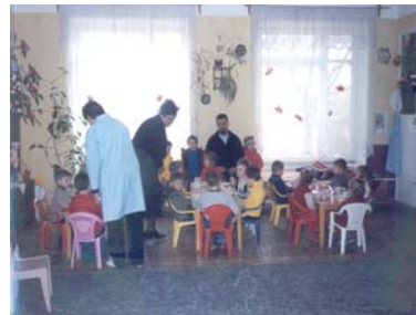
The Korolevo Parish Orphanage