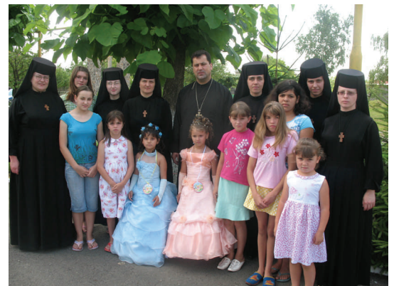
Korolevo Orphanage, managed by the Sisters of St. Joseph

ORPHANAGE — In this house dwell twelve children who are orphans, and also 54 children from needy families.