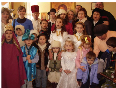
Tsehólnaya parish children waiting for Saint Nicholas in 2008. In 2010, they hope to greet the Saint in their own church.