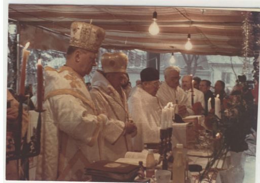
Outdoor services at the Tsehólnaya church have taken place since the spring of 1991. The Orthodox parish refuses to share the church, or to honor the city decree and return it.