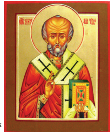
St. Nicholas, Bishop of Myra

Nicholas himself is the saint of charity, of justice, and of orthodox faith, as he is hailed in legend as defeating the heretic Arius at the First Ecumenical Council. The Catholic monks left Chernecha Hora in the back of Red Army trucks in 1947, to be temporarily replaced by Orthodox monks, but in 1956 these monks were dispersed during the fierce anti-religious purge of Khrushchev, and the nuns from the four Orthodox convents in Transcarpathia were ordered to settle in Saint Nicholas’ walls as their houses were forcibly closed. Today the monastery remains, with about 70 Orthodox nuns, and a large pilgrimage church in Russian style soars above the cemetery and monastery alike. One wonders what Saint Nicholas, who was so charitable, makes of all of this shuffling around of monastics and properties? The ongoing division of Catholicism and Orthodoxy must surely come to an end someday, and the pain of the past must find healing in the balm of divine love. Saint Nicholas’ bones still give off myrrh at his tomb in Bari, Italy, and there are Catholic and Orthodox churches there to receive his blessings. Until the day of reunification comes, we turn to him asking for his continued heavenly intercession for our Ruthenian Church and our work for its restoration.