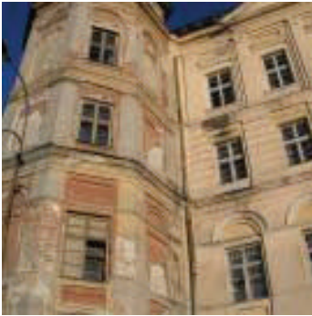
One of the towers before restoration work began

Originally the Jesuit College, this building and the church were given to the Greek Catholic Eparchy in 1775 by the Austrian government after the Jesuits had left. At the time, the town of Ungvar was in the center of the enormous eparchy, which covered territory from central Slovakia into northern Romania of our day. In 1945, Stalin drew his pencil mark along the land just west of the Uzh River, and thus sliced off the eparchy from Czechoslovakia and put it into the USSR. After 1991, the eparchy was thus in independent Ukraine.